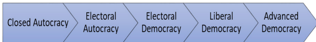
Figure 2. Combined Schedler and V-Dem Democracy Continuum.

In addition to Schedler’s continuum, V-Dem classifies countries on a similar four category continuum consisting of Liberal Democracy; Electoral Democracy; Electoral Autocracy; and Closed Autocracy. These four categories are similar to Schedler’s but the difference is that there is no category for advanced democracy and there are two subcategories for autocracy. Despite this, there is still a relationship that can be drawn between these terms. By combining these two concepts the following continuum is possible: